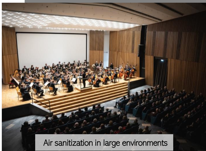
Air sanitization in large environments

TONALI E.A. was born in 2019 from a multi-year synergy with BlackBox Green (group company). TEA provides integrated systems dedicated to energy efficiency and environmental monitoring for the protection of the territory and people.