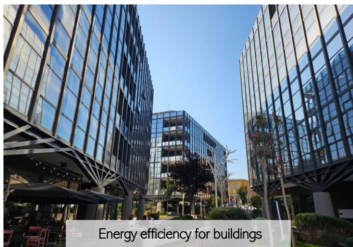
Energy efficiency for buildings