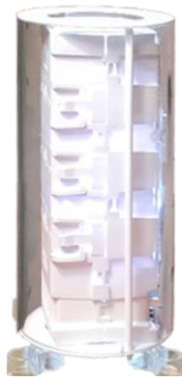
SANIXHOTEL TABLE SOLUTION