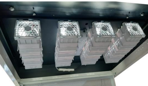
SANIXHOTEL INSTALLED ON THE CEILING