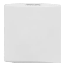
T BOX METEO Master / Slave